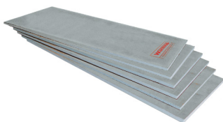
Warmup Insulation Boards