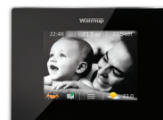
4iE Smart Wifi Thermostat