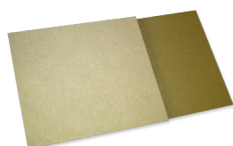
Dual Overlay (WDO)