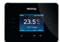
3iE Energy-Monitor Thermostat