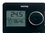
tempo Programmable Thermostat