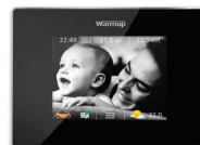
4iE Smart Wifi Thermostat