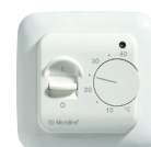
Manual Thermostat MSTAT