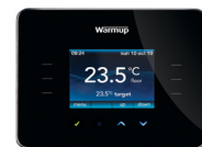
3iE Energy-Monitor Thermostat